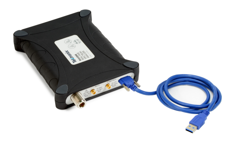
Figure 1: RSA306B Real-Time Spectrum Analyzer

The RSA306B is a portable, 40 MHz Real-Time Spectrum Analyzer that contains an acquisition system inside a small module. The user interface and display resides on a user-provided PC running SignalVu-PC software or a user-developed application. The host PC provides all power, control, and data signals over the USB 3.0 cable included with the instrument. An available software application programming interface is provided to allow you to create your own custom signal processing application.