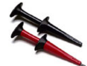
AC280-FL: Hook Clips.