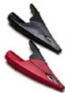
AC285-FL: Alligator Clips.