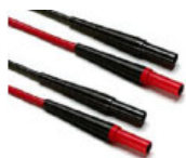
196-3523-00: Extender Leads (1.5 m).