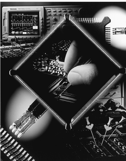
► SF500 Series (Surefoot)