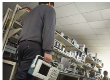
Lightweight design for easy transport from lab-to-lab.