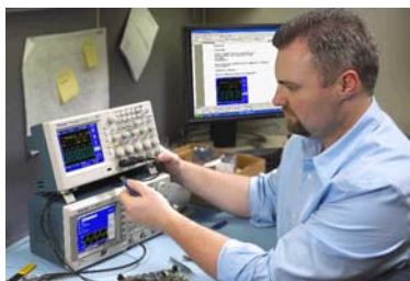
Easily store and transfer waveforms and measurement data to USB.