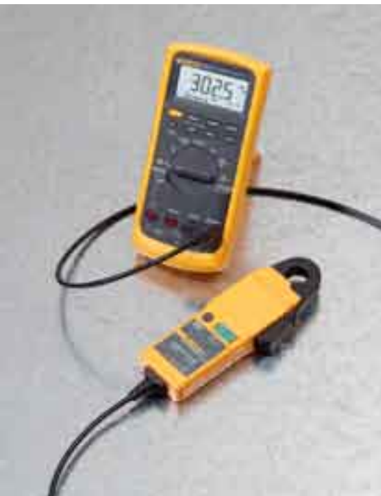
i30 connected to a Fluke 87V Digital Multimeter.

Fluke. Keeping your world up and running.